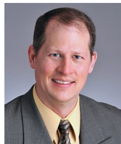
Vascular and interventional radiologist, researcher, and developer, and Chief Scientific Officer, Penumbra, Inc.