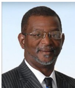
Senior counsel at Dykema Gossett, PLLC