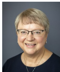
Vice chancellor for Academic Affairs and professor, Washington State University Health Sciences