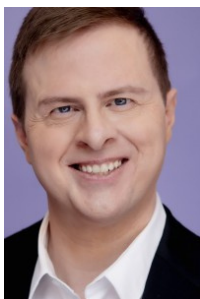
Founder, Executive Director Able Artist Foundation