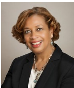
Co-CEO Burrell Communications Group