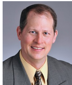
Vascular and interventional radiologist, researcher, and developer, and Chief Scientific Officer, Penumbra, Inc.