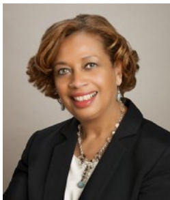
Co-CEO Burrell Communications Group