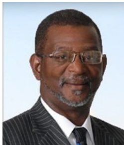
Senior counsel at Dykema Gossett, PLLC