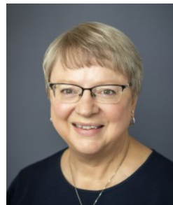
Vice chancellor for Academic Affairs and professor, Washington State University Health Sciences