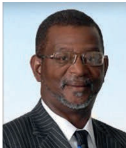
Senior counsel at Dykema Gossett, PLLC