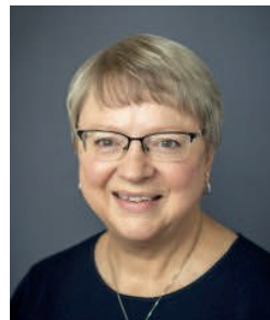
Vice chancellor for Academic Affairs and professor, Washington State University Health Sciences