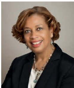
Co-CEO Burrell Communications Group