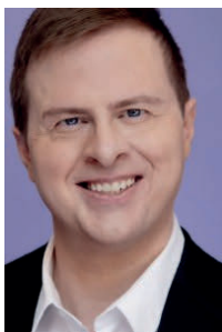
Founder, Executive Director Able Artist Foundation