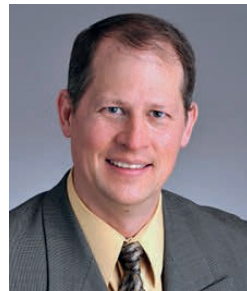
Vascular and interventional radiologist, researcher, and developer, and Chief Scientific Officer, Penumbra, Inc.