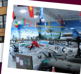
Fargo Air Museum