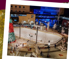
Ice Skating Downtown