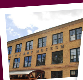
Plains Art Museum