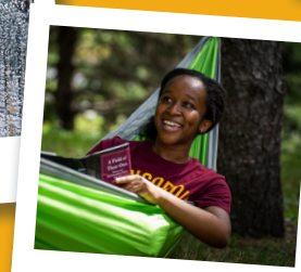
Hammocking in the Park