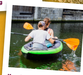
Kayak the Red River