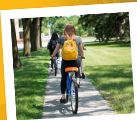
Miles of Biking

Kayaking, hiking, biking, or skating (and more!) — the area boasts hundreds of miles of parks to explore.