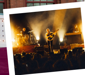
UP District Festival Field

The 1926 historic Fargo Theatre sets the stage for an active, engaging, and inclusive arts culture. Whether you're into live music, theatre, or visual arts, you'll find plenty of ways to experience culture and creativity.