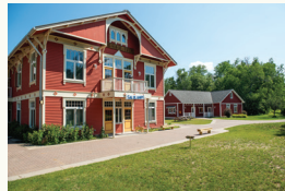
Salolampi Finnish Village