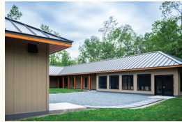
Sup sogūi Hosu Korean Village

We'll provide a serene backdrop, global character, and personalized service.