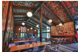
Skogfjorden Norwegian Village